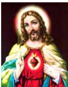
- ഒരു വിശ്വാസി