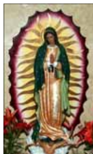
- ഒരു വിശ്വാസി